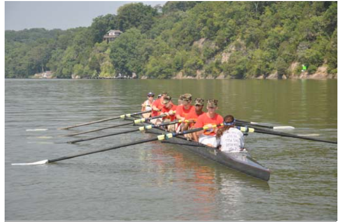
YM listening to the coxswain's instructions in the 8-man racing shell.