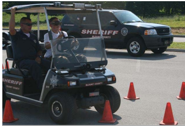
YM driving with the "Drunk Driving Goggles" - look out for that cone!