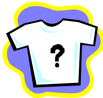
A Marine at the Reserve Center is designing this year's Mud Run t-shirt.

Our 6th Annual Marine Mud Run is scheduled for Saturday, 19 September, again at Knox County's Melton Hill Park and we have a lot to do between now and then. We still have time to get out and contact possible sponsors for the race. We already have a few sponsors, including Coca-Cola for drinks, more. Sponsor various sponsor receives are available for our website.