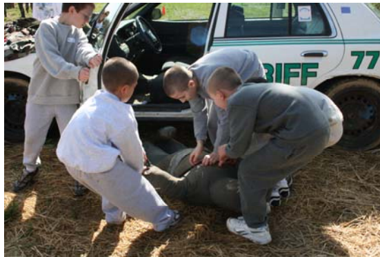
Dragging a 185-pound dummy is really hard, even for these four YM Recruits.