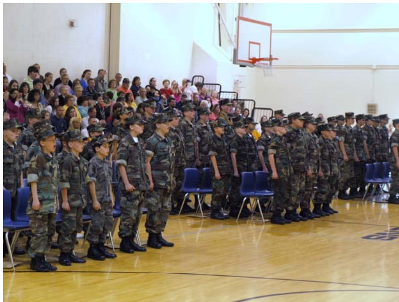
New Young Marines recite YM Obligation at 2009 Recruit Graduation.