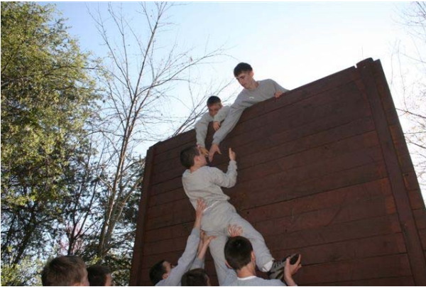
YM recruits work as a team to get a recruit over the 12-foot wall obstacle at the Blount County Sheriff's Office Training Center.