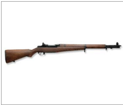
M1 and M1A service-grade Garand rifles must be used to compete for the trophy.

The cost will be $20.00, the same as last year; there is no cost if you just want to come out to watch. (or perhaps cheer on the participants?) At the March 2009 Detachment meeting, the members voted to only allow shooters competing M1 or M1A service-grade rifles. Of course, shoot for fun, you you want to bring shooting club will available but make with Doug Calvert one of those rifles the club. We will rounds, with a mix in the prone posi-(off-hand) posi-should be over be-