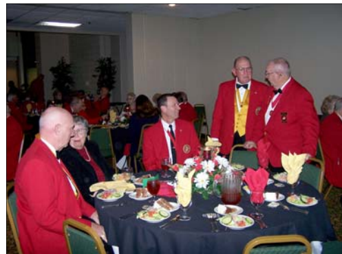
Detachment members and spouses at the SE Division Convention banquet.