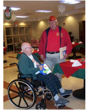
Pictures related to League and Young Marine parties at the Atchley State Veterans Nursing Home in December 2008.